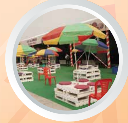
UP Ka Swad (Cuisine and Culinary Arts)